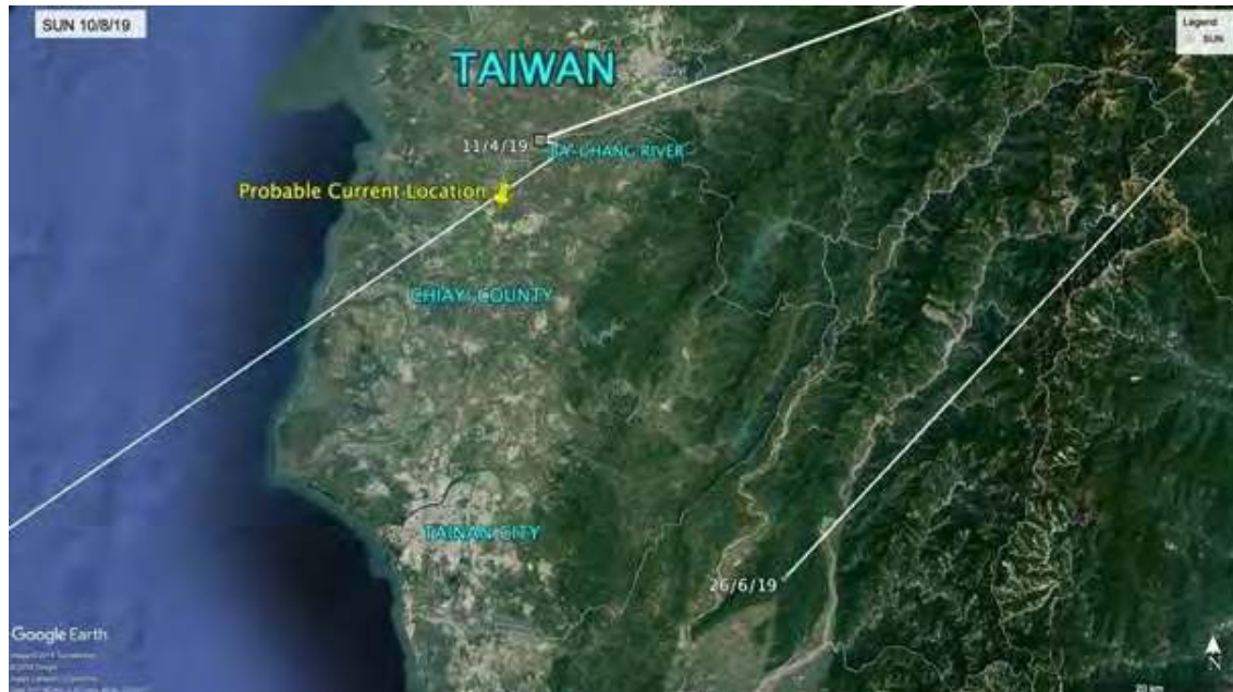
Figure 7 - SUN – Still no accurate readings. Pinned area marks probable location from last reading (low accuracy) 1/9/19.

In the very slim hope that we may receive some data, this map will remain on this final page for a little longer.