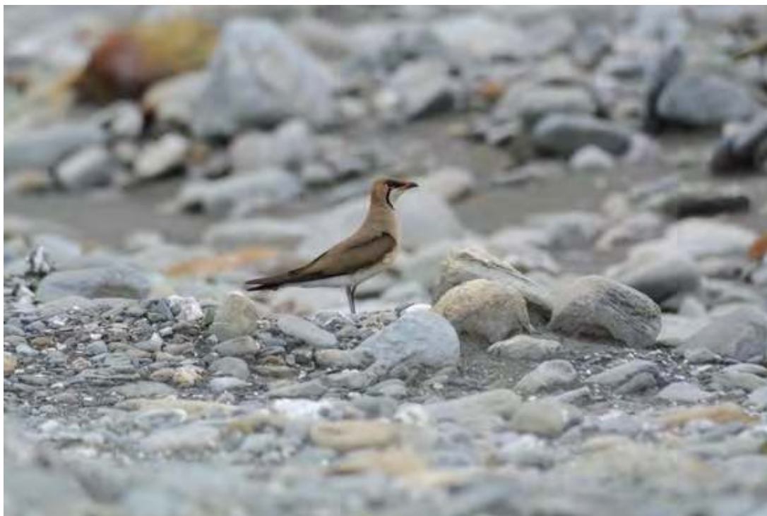
Photo 2 – Oriental Pratincole in west Taiwan