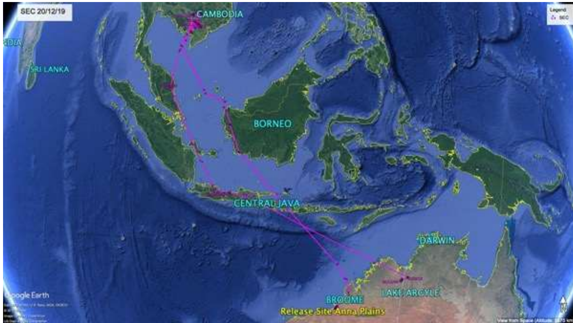
Figure 2 – SEC 20/12/19 – Currently around Lake Argyle, 850 km from the Eighty Mile Beach release site.

Departing Anna Plains on February 26th, 2019 and with its breeding site in Cambodia, this makes a total return trip of over 8000 kms.