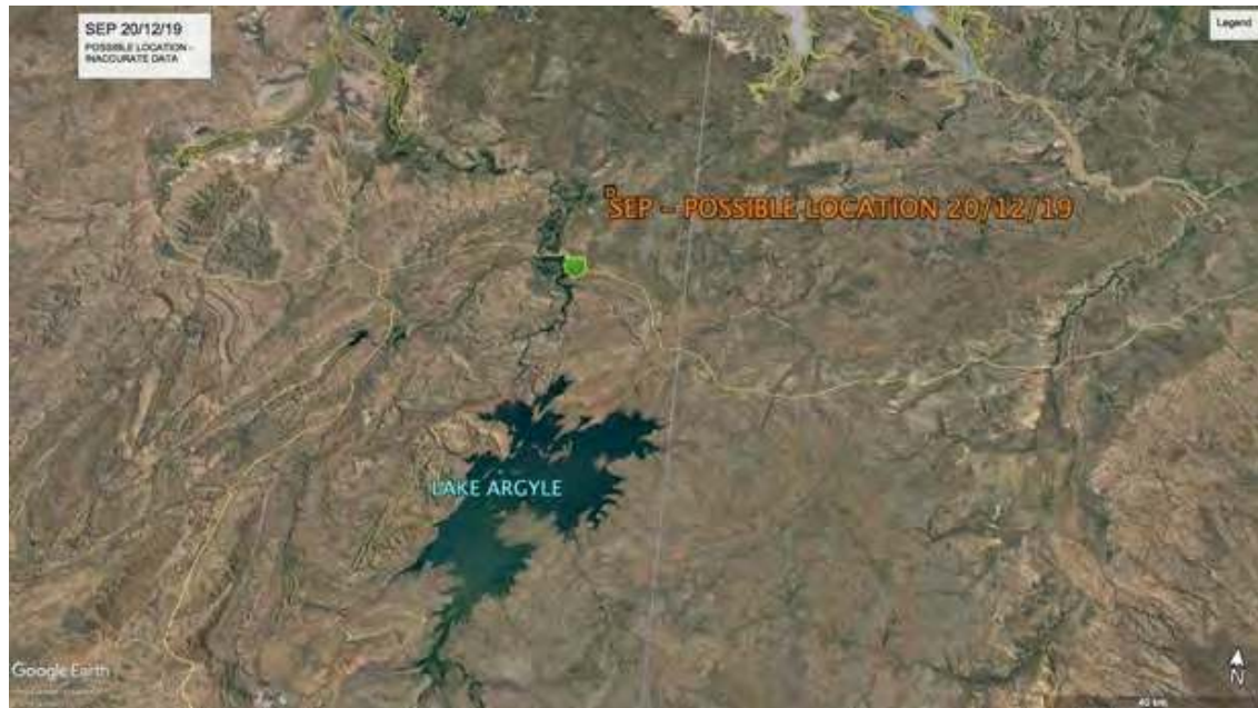
Figure 6 – Poor quality data showing that SEP is likely around the Lake Argyle region.

After very limited, inaccurate data in mid-November showing that SEP may have travelled to South Sumatra, we once again received more poor-quality data on the December 20th suggesting SEP is now north of Lake Argyle. It is unfortunate that the PTT is not providing the same quality data as SEC and SHE, missing the opportunity of discovering SEP’s route and timing of its flight south. Regardless, after a breeding attempt in India, SEP as completed an extraordinary return trip of over 13,000 km, 5000 km more than its Cambodian breeding counterparts.