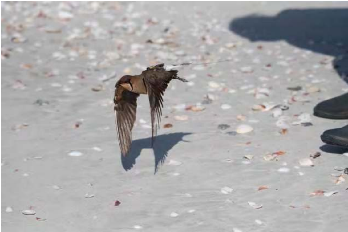
Photo 3 – Release of Oriental Pratincole, Eighty Mile Beach, 42 km south of Anna Plains Station, Western Australia

*** Two breeding attempts in different locations within Cambodia