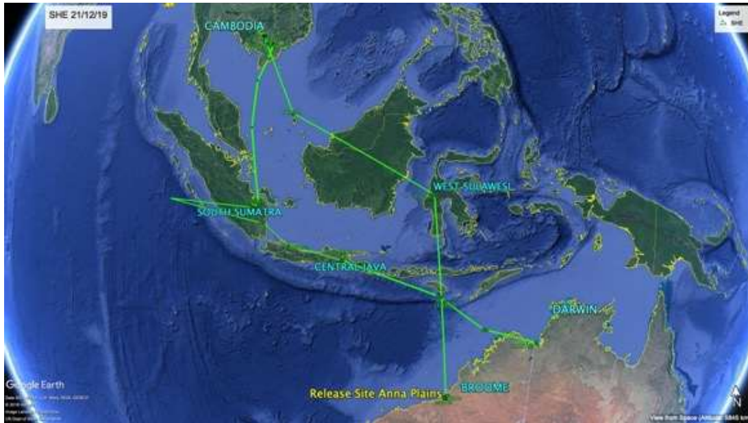
Figure 4 – SHE 21/12/19, from Central Java to the Australian mainland in less than 48 hours.

SHE is currently 980 km north east of the Eighty Mile Beach release site and has completed an 8700 km round trip.