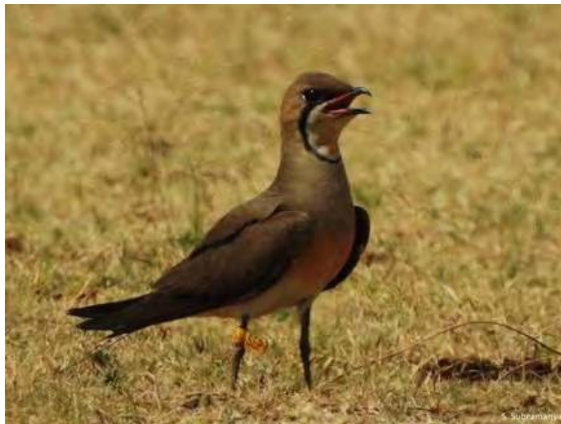
Photo 1 - SEP on the breeding grounds in India