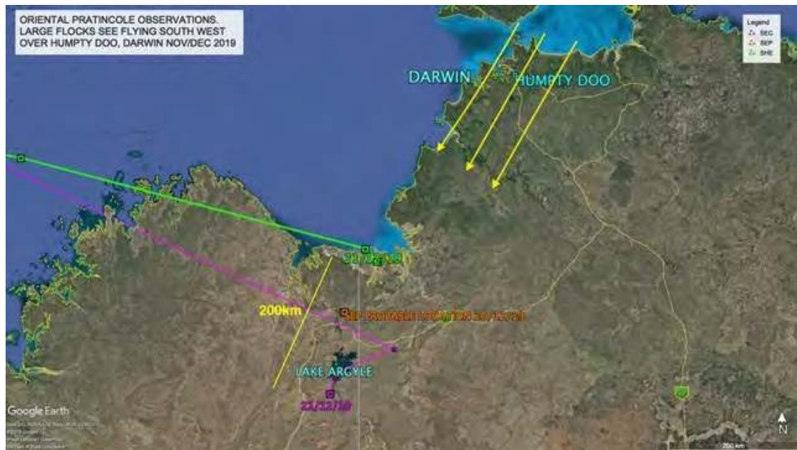
Figure 8 – SHE, SEP and SEC all within 200 km of each other with some independent observations of large flocks of Oriental Pratincole flying south west over Humpty Doo, Darwin.

Unlike the more predictable behaviour of the coastal dependant waders that more or less utilise the same roosts and foraging areas, it will be interesting to see what movements the Oriental Pratincole make between now and February as the wet season rains bring about the right conditions for insect breeding.