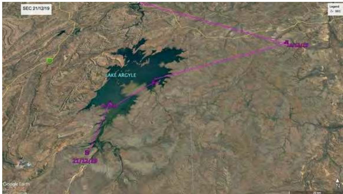
Figure 3 – SEC, recovering from its long flight on the banks of Lake Argyle.