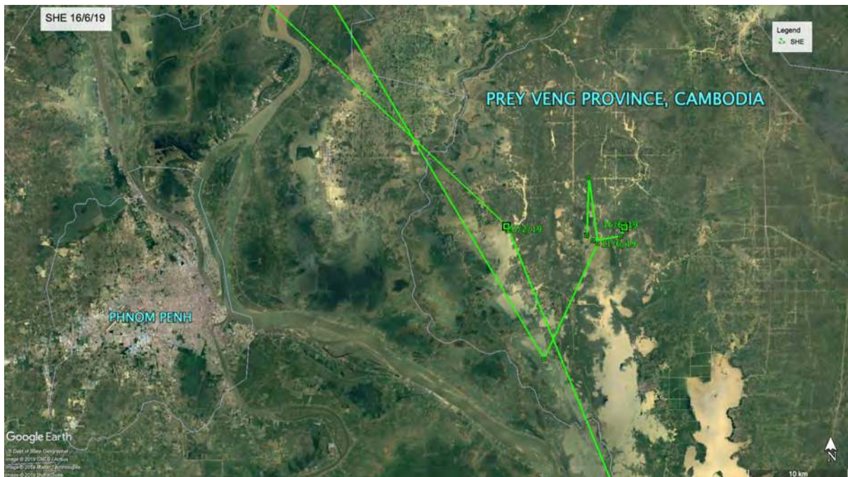
Figure 4 – SHE – now in Prey Veng Province

Around 30 May, after 97 days at its Tonle Sap Lake location, data shows that SHE started making moves south. From around 2 June SHE has been in Prey Veng Province, 170km south east of its breeding site. SHE's current position is less than 20km from SEC's (probable) breeding site and as mentioned previously, Prey Veng Province - the "great green belt" of Cambodia, with its floodplains and fertile soils, is likely to be prime habitat for the Oriental Pratincole.