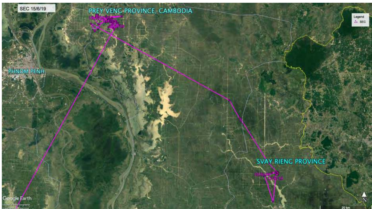
Figure 5 – SEC –Svay Rieng Province, Cambodia

After approximately 70 days in its Prey Veng location, with breeding likely to have occurred SEC made its initial move south on 28 May. From around 30 May SEC has been located approximately 90km south east of its Prey Veng location, in the considerably smaller Svay Rieng Province, less than 20km from the Vietnam border. Interestingly Svay Rieng is considered the poorest province in Cambodia, due to the poor quality land, reportedly due to “American carpet bombing” during the Vietnam War, destroying the forests and creating a “cratered countryside”. SEC seems to be content staying close to the Waiko River .