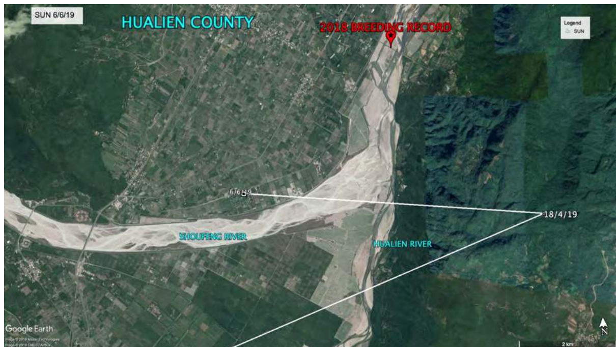
Figure 2 - SUN – Last accurate reading 6/6/19, approximate location Hualien County, Taiwan.

In terms of accurate location data, SUN, (or rather the PTT attached to SUN), continues to keep us guessing, making it difficult for us to pinpoint an area to organise a search. But as has been the case for several weeks now, the less accurate readings we have been receiving continue to show that SUN is still in this area and once the data is adequately analysed we are confident that the information will confirm our beliefs.