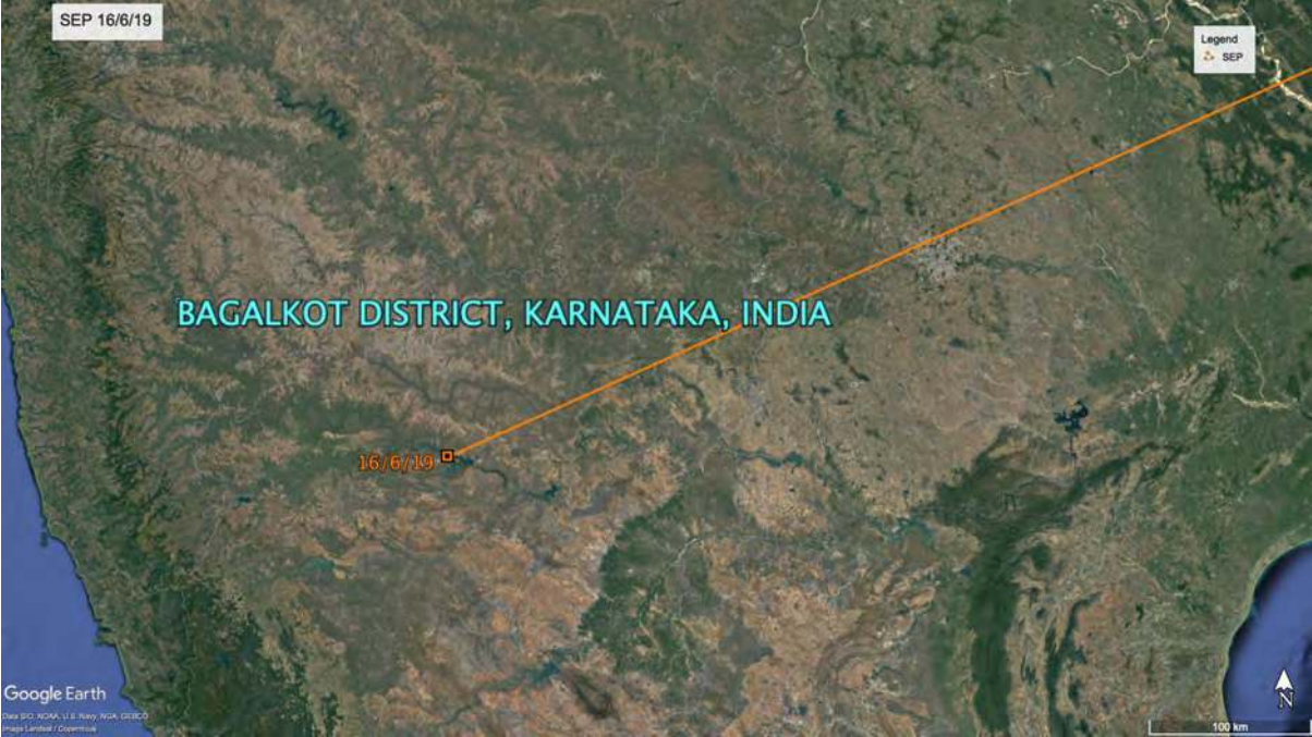
Figure 3 –SEP – Heggur Villages, Bagalkot District, Karnataka, India.

After 55 days, SEP seems quite settled and continues to make local movements at its chosen breeding site. It will be interesting to see how long SEP will stay in this area and, after breeding, its southern migration route.